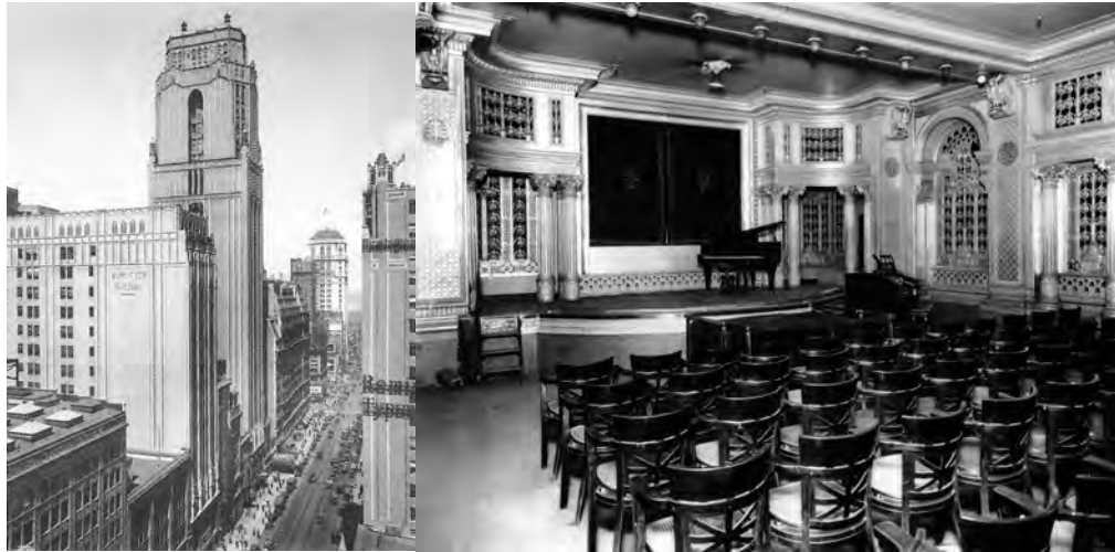
The Wurlitzer Building and Wurlitzer Hall on West 42 nd Street at the height of its fame.