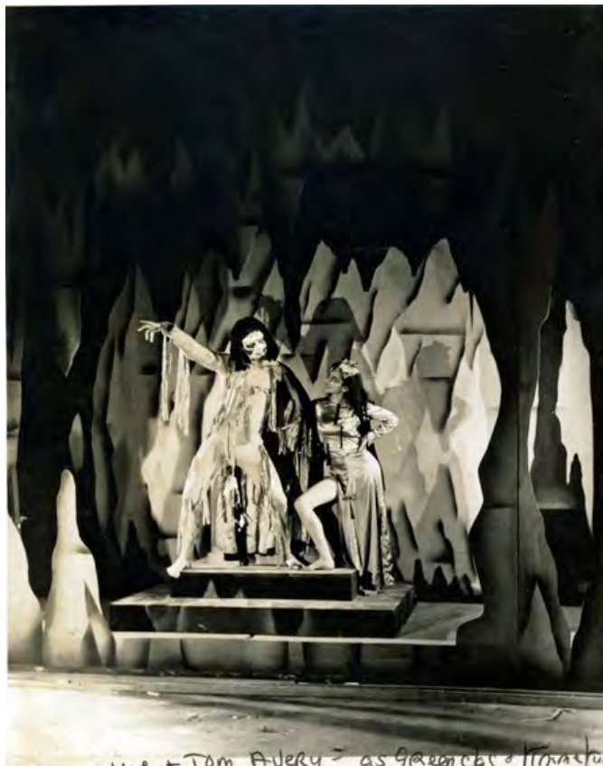
A previously unpublished photo of a young Shirley Clarke dancing as a member of the Carolina Playmakers theater group at the University of North Carolina.